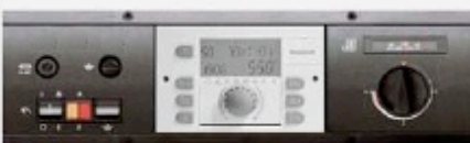
ON series automatic eco control panel

Thermix is a system designed by Önmatal . With tightening cross sectioned design and with turbulence wings , adaptor gives high speed to the return water of the boiler. Hot boiler water in the back sections of the boiler can be transferred to the front sections with the help of this turbulanced high speed water. With this way , hot water mixes with cold return water of boiler and temperature of return water increase .As temperature of the water which goes to back side of the boiler rises, condensing is prevented.